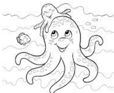
Linea Pagine 1000 - 1000